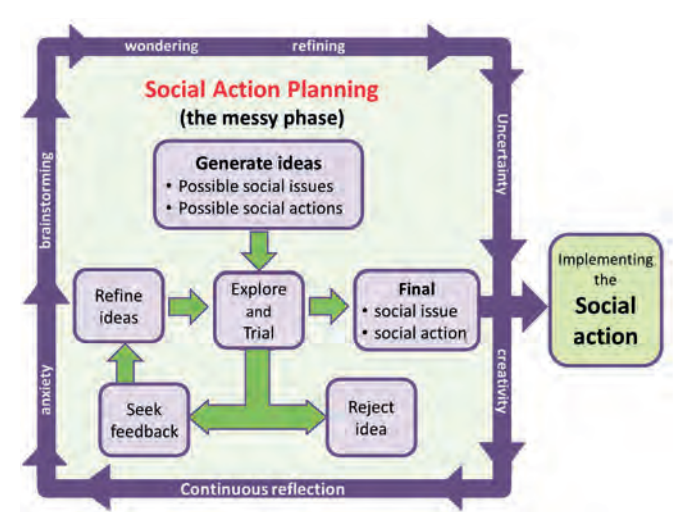
FIGURE 1. PLANNING A SOCIAL ACTION

Two students (Year 10) described how they "had a completely different topic at the start, [which didn't work out] then had to start the whole thing, kind of like rebooting a computer".