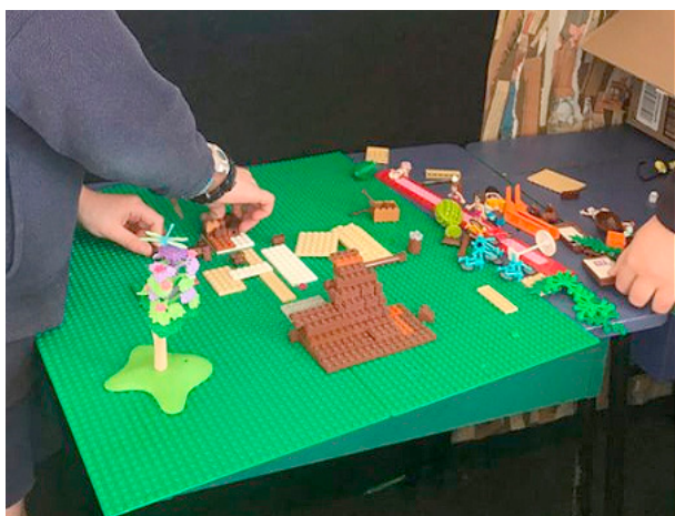
FIGURE 1. STUDENTS BUILT MODELS OF THEIR VISION OF THE WATERFRONT TO SHARE WITH COUNCIL AND THE COMMUNITY. SOME CHOSE TO BUILD A PHYSICAL MODEL AND OTHERS UTILISED DIGITAL TECHNOLOGY TO CREATE THEIR MODEL.

The students started to work on a “new” waterfront area but, when they were challenged to think about what would need to be included in a sustainable waterfront that would be good both for people and for the environment, they realised that it did not need to include cars. The teacher working with the students said it was like someone had pulled out the stopper on their creativity once the students realised that cars didn't need to take priority. The students did not stop at redesigning the waterfront. They started to redesign the whole town so that it would be a place that is good for people and the environment. The students knew people still needed to move around town which led to them finding out about the ways people travel now. Where did they go in a car and what are the alternatives? Where could they bike or walk and what could public transport look like in their town where there is currently none? What did people with limited mobility need to access the waterfront area and town? The students went on to build models of their vision of the waterfront to share with the council and the community.