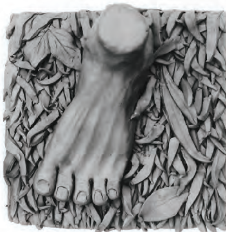
5.6 My Foot on the Grass , clay tile by Warren, Form 4, Papatoetoe High School, 1976.