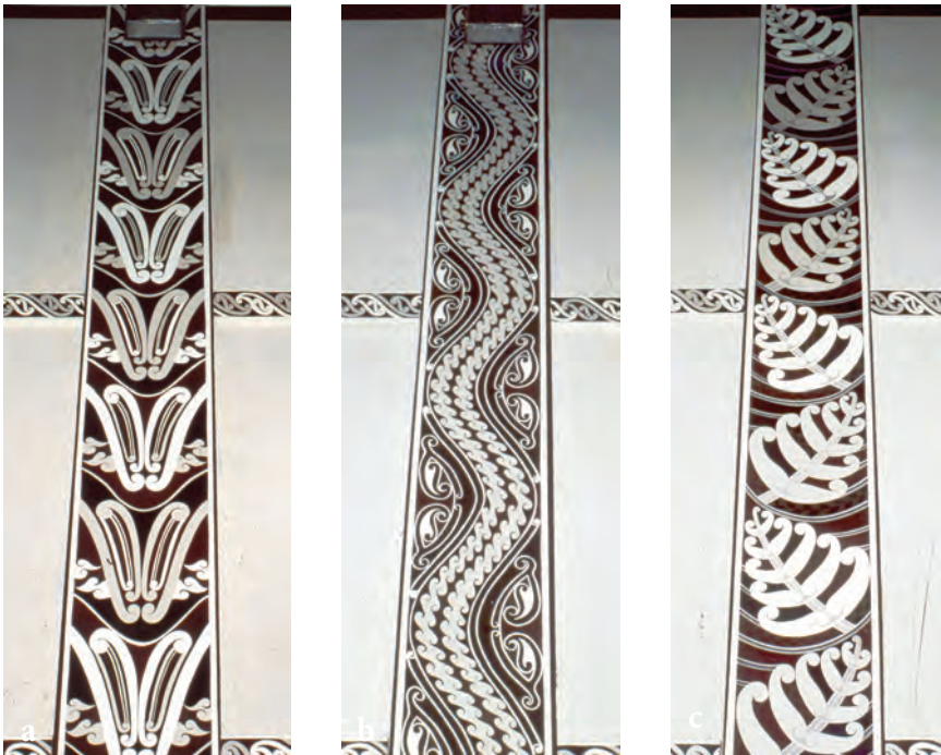
6.5 a–c: Kōwhaiwhai on the heke in Te Huki: Maungaharuru, Mohaka River and Raupunga, 1988.