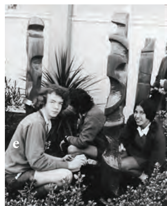
5:7 a–e: Form 4 pupils, Papatoetoe High School, carving and erecting their posts, 1972.