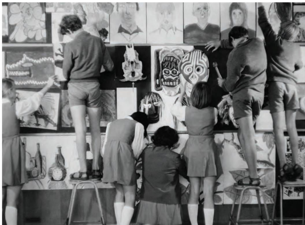
5.4 Form 4 pupils, Papatoetoe High School, mounting a display of their work in the art room, 1970.