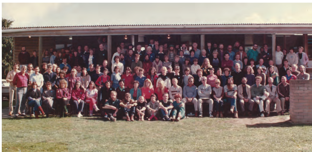
6.7 Delegates at the first Auckland–Northland regional art conference, Camp Adair, Hunua, 25–27 April 1984.