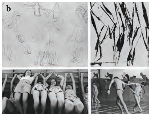
5.8 a-f: Form 5 students' art-making on the theme of movement, School Certificate art, Papatoetoe High School, 1977.