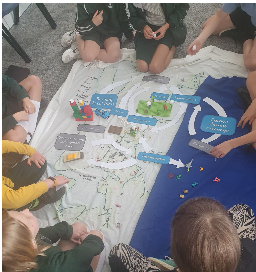
FIGURE 2 Interactive carbon cycle activity

The final Mana Ora event was a celebration day in November 2023, coinciding with the Auckland EnviroSchools celebration event. All Mana Ora schools and projects were invited to bring the lead teacher and up to four students to the gathering. Participants from 11 of the English-medium projects were able to attend, mix and mingle, hear speeches, and showcase their project in a small walk-around exhibition area.