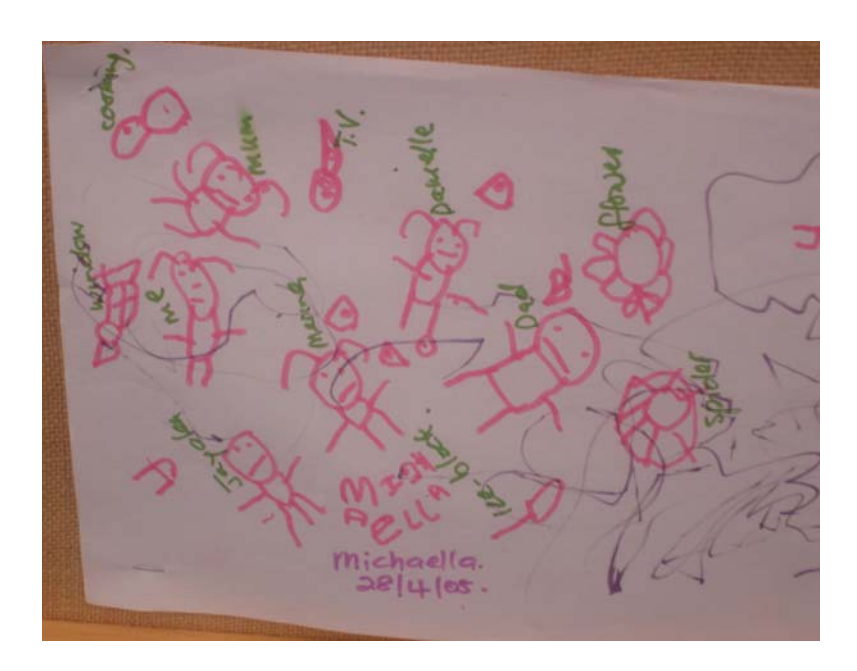
Figure 4 Child's art work with captions added in English

Teachers used the children's art work as a springboard for writing stories for them and with them in Samoan. When the children spoke or wrote in English the teachers translated their ideas and wrote their story using Samoan. They encouraged children to use Samoan in their writing activities. A number of photographic examples of such work were taken. As one teacher said: