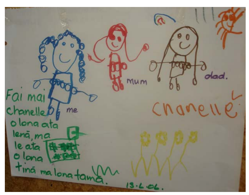
Figure 5 Child's story written by teacher in Samoan

I am allowing children to be independent and to take part in early literacy. I am writing children's stories about their paintings. (Teacher 1 interview, 25 July 2006)