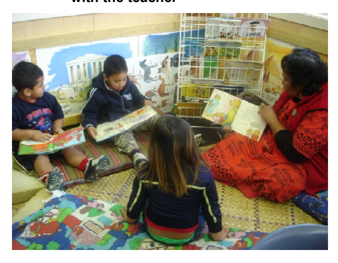
Figure 6 Children read books together and with the teacher