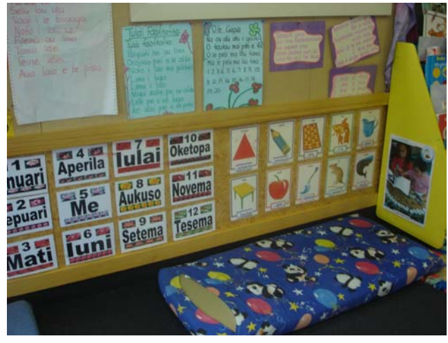
Figure 3 Children "reading" Samoan alphabet chart